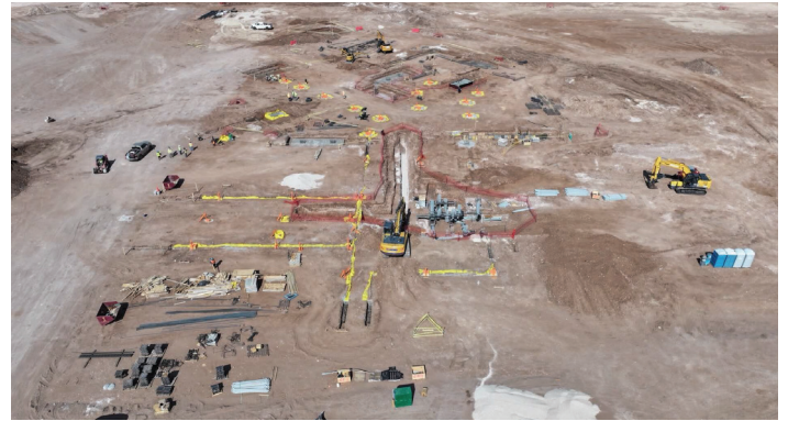
Permian Basin Behavioral Health Center on-site progress, May 2024

Approximately $216 million has been formally committed to the project by the State, local government, regional foundations and private individuals. Fundraising efforts